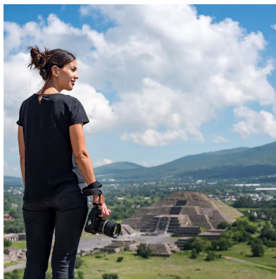
Mexico City area pyramids

The historical foundation for forming a relationship between UAE and LLE has roots as an ancient pathway called El Camino Real or The Royal Road. Today, El Camino Real connects the University of Albert Einstein located near Mexico City, Mexico with its nearby Sun and Moon pyramids, and Lifelong Education located in the Austin, Texas, USA area. For centuries, the Eastern El Camino Real followed natural springs and waterways from Mexico City northward through the Austin Texas area, to the East Texas and Louisiana area border town of Natchitoches, an area settled for over 10,000 years. El Camino Real was traveled by many ancient Native American civilizations in Central and North America. They shared cultures and traded goods long before the Europeans arrived hundreds of years ago and joined in using it as their trade and exploration route. Today, remnants of El Camino Real exist in portions of superhighways, and Texas State Park historical sites such as McKinney Falls State Park and the Barton Springs Pool near the Colorado River in Austin. Today, the pathway also exists in another way: in the sharing of our cultures, trade between our nations and now as an alliance pathway in UAE and LLE's collaborative missions of expanding consciousness and a culture of peace in the world.